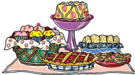
New Member Dessert